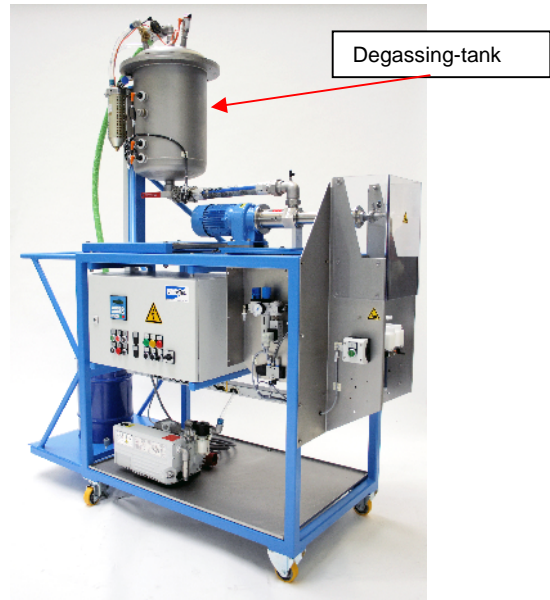
ViscoFill-system with degassing unit